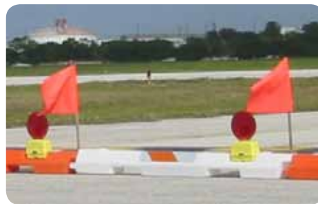
Interlocking connection system is made simple with flag handles. *sold separately