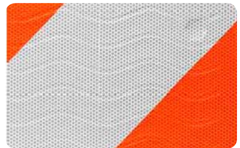
Barricades include orange / white high intensity reflective sheeting to maximize visibility.

NAC is a certified MBE and SDVSB providing airport services and safety solutions.