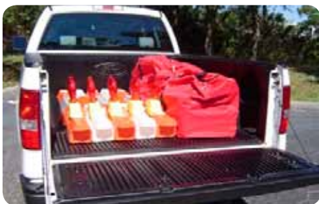
NAC's barricades are portable and easy to use.